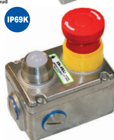
TYPE: ESL-SS(L) Stainless Steel 316 with 2-Colour LED