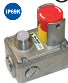
TYPE: ESL-SS(LP) Stainless Steel 316 with 2-Colour LED and Protection Shroud