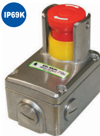
TYPE: ESL-SS(P) Stainless Steel 316 with Protection Shroud and Padlock Holes