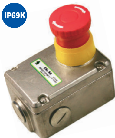
TYPE: ESL-SS (Stainless Steel 316)